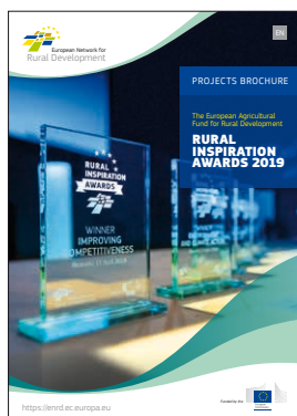
EAFRD Projects Brochure Rural Inspiration Awards 2019