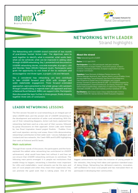
Event Highlights - networX