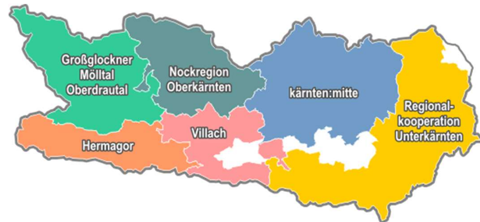
Map of LAGs in your country

A lot of projects in all sectors (rural tourism, cultural, nature, environment, economic, social) were implemented or are in progress